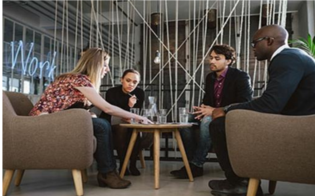
Fig 5.2 recruitment process undertaken in office