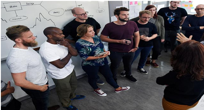
Fig 5.1 New employees being given orientation